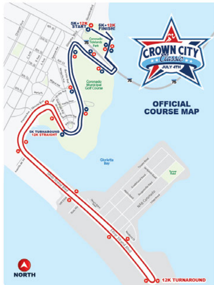
2025 Proposed Course Map

The event organizers would like to request to hold the 52 nd running of the Crown City Classic on July 4 th , 2025. To celebrate the 52 nd running of the event. We plan to host our original distances of 12K, 5K, and ½ Mile Kids Race. All races will start and finish at Tideland Park.