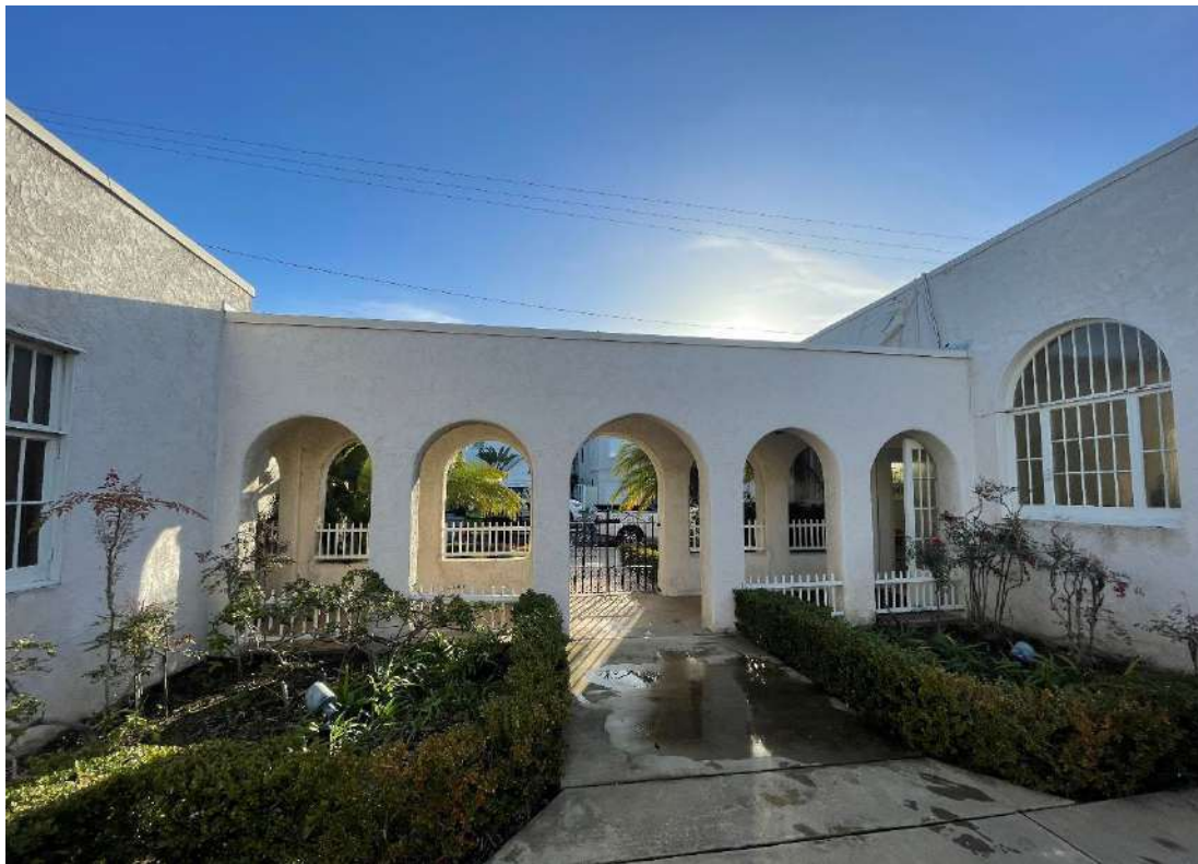
MAIN COURTYARD (looking southwest towards 8 th Street property entrance) Christian Science Reading Room on left , Montessori School on Right