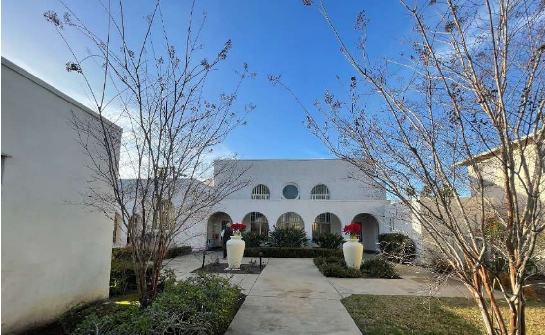
MAIN COURTYARD (looking northwest at the church entry)