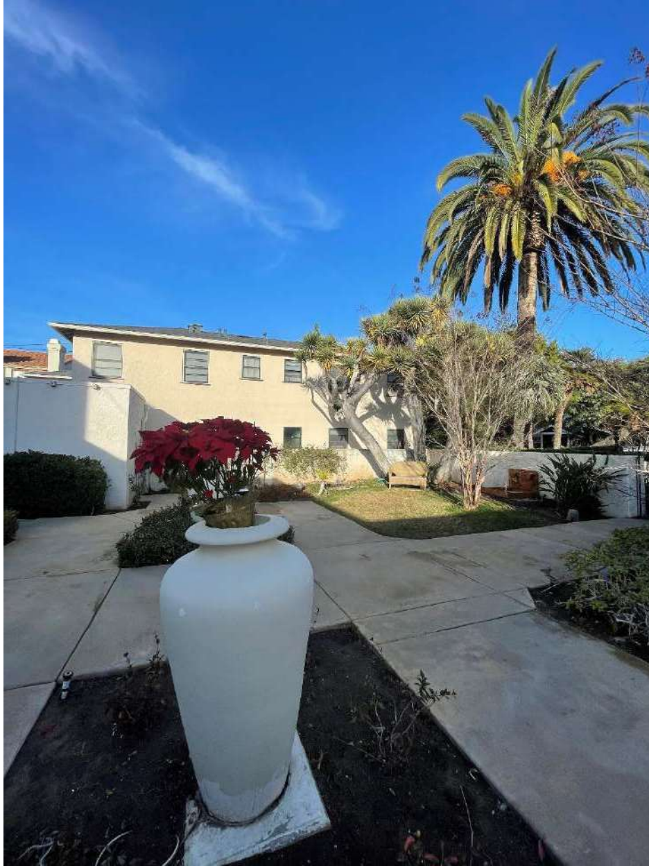
MAIN COURTYARD / INTERIOR SIDE YARD PROPERTY LINE (looking northeast/southeast towards C Avenue property entrance)